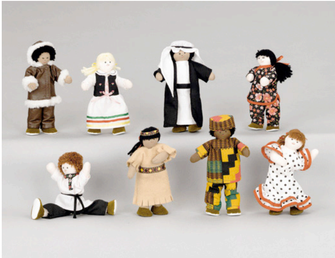
A selection of ethnic costumes, Fanny's Play House Inc.

People define themselves through language and create their own sub-cultural linguistic fields, their own 'tribal' codes, in order to establish their identity and be identified by other members of their 'tribe'. This might be done through the clothes they wear, the language they employ or the means through which they transmit their messages. This is an iterative process where people evolve new dialects that in turn define self. Transculturation functions not only within the established context of the colonial but also the post-colonial, where human migration has proceeded, for multiple reasons, in multiple directions.