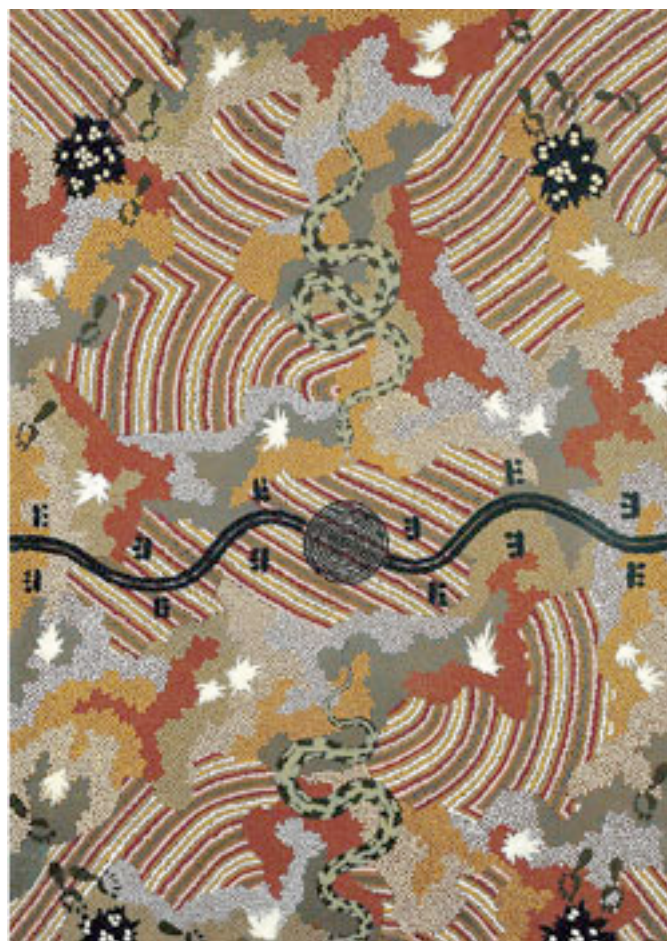
Clifford Possum Tjapaltjarri's painting 'Carpet Snake Dreaming', 1991-92.

European hermeneutics, along with the pre-eminence of the word, is a product of an education and knowledge system with largely Medieval origins, established in part by the Roman Catholic Church. The modern university, as we recognise it today, evolved during the enlightenment. Its departmental structures and hierarchies can be regarded as maps or diagrammatic visualisations of how knowledge has evolved and come to be relatively valued across disciplines. Knowledge and language are bound together within the resultant taxonomies, reflecting the ideological foundations of knowledge/language as ecclesiastic, nationalist and industrial.