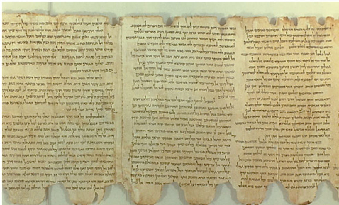
Dead Sea Scroll

Language is motile, polymorphic and hybrid. Illuminated manuscripts, maps, graphic novels, the televisual and the web are similar phenomena in that they evidence language to be something that has never been restricted to the word. Language has always included the visual, aural and tactile.