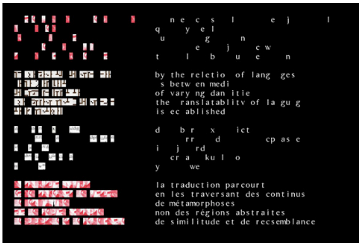
Image from Translation, by John Cayley with Giles Perring, www.shadoof.net

compromised. Cayley writes of language 'drowning' and 'resurfacing' throughout the work, suggesting that the legibility of the text is the necessary oxygen the reader requires and will always seek, even struggle, to find. What happens when that oxygen is removed and the 'text' abstracted to its material and a-semiotic components?